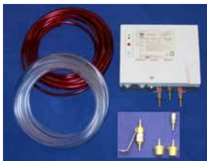
Complete set including for all necessary installation equipment