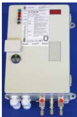
VL 330 P in a protection box