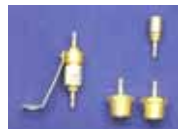
Installation kit for the tank