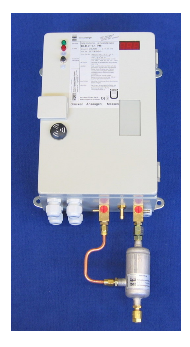
DLR-P 1.1 PM Weather protected design with integrated pressure indication