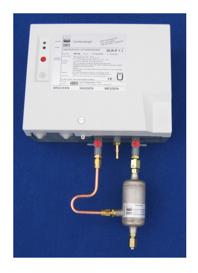
DLR-P 1.1 in plastic housing

for double walled pipes and double walled fittings in several variations: