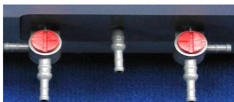
Two three way cocks and connection for PVC-hoses

Additional terminals for the connection of external signals and potential free (dry) relay contacts for alarm transmitting are standard.