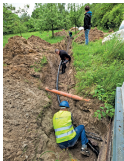
Routing around underground obstacles

In combination with our approved leak monitoring systems Class 1, which can be used without additional requirements in all plants subject to acceptance tests (LAU/HBV). Compliant with all water protection law regulations and the requirements of fire and explosion safety.