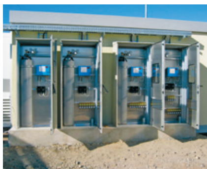
Simple securing of FLEXWELL® Safety Pipe using system technology