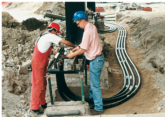
Easy installation on site