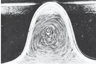
Spirally corrugated pipe: no dead-water zones, constant turbulence